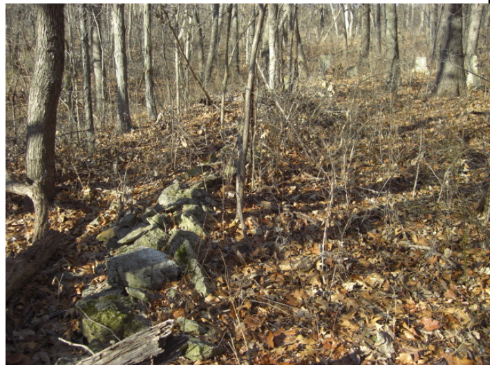
You can see an old stone wall here.